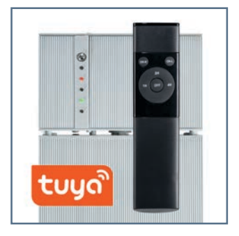
Remote or app for convenient control.