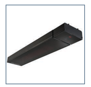
Optional flush mount kit available for recessed surface mounting.