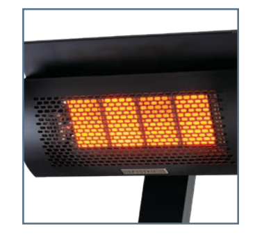
34MJ, 4 tile commercial grade ceramic burner, with market leading wind protection rating of 16km/hr