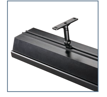
Easy installation with brackets included. Suitable for ceiling or wall mounting.