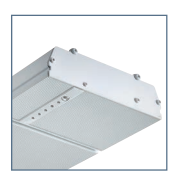
Control Panel with On/ Off functionality, High/Low temperature settings, 1/2/4 hour timer.