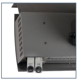
Electronic, battery-operated finger pull On/Off controls, makes operation so easy and effortless.