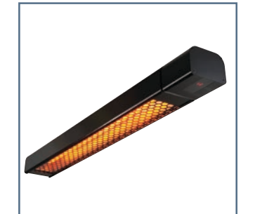
High performance infra-red electric heater. That provides instant heat.