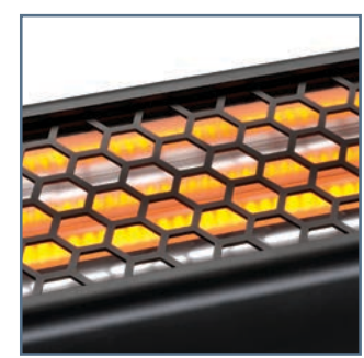
Includes a high-performance carbon filament electric infra-red element, providing instant heat.