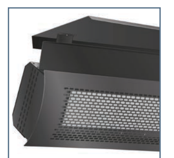
Heater built from stainless steel with high temperature paint coating.