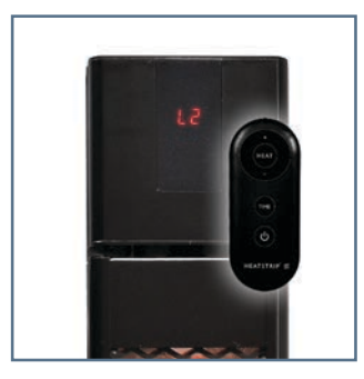
App and remote control provides 3 heat levels with adjustable timer options from 0-24 hours with the touch of a button.