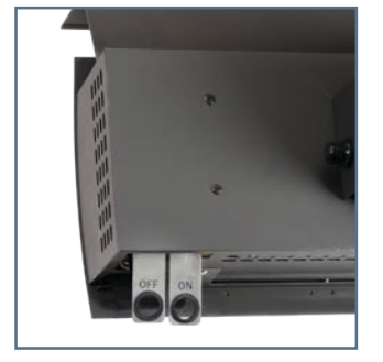
Electronic, battery-operated finger pull On/Off controls, makes operation so easy and effortless.