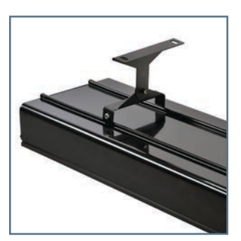
Suitable for wall & ceiling mounting or suspension via chains or wires.