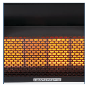
34MJ, 4 tile commercial grade ceramic burner, with market leading wind protection rating of 16km/hr