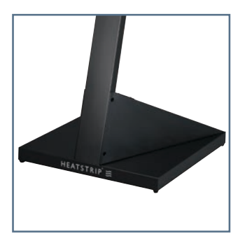
Ideal for indoor and outdoor use. In-built wheels for easy portability and storage.